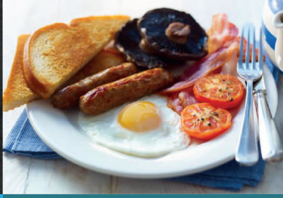
Meals & Refreshments

All team members are eligible to park on site in the designated areas.